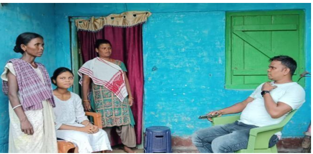
Arrival of Skills Trainees in CDI

The visits were done to recruit the young girls for CDIs residential skills training programme with the primary goal of empowering them leading to financial independence and enhancement in their well-being and quality of life. The other purpose was to prevent them from becoming victims of human trafficking.